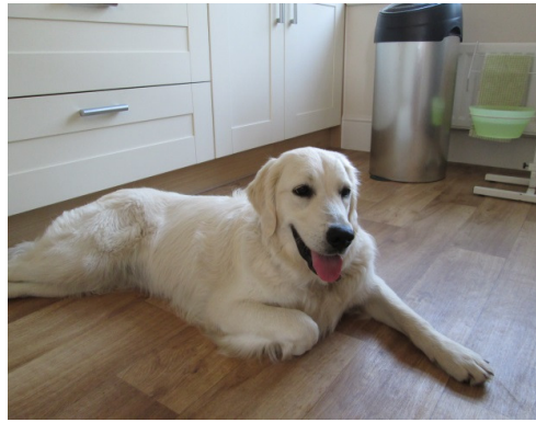
Bella's favorite place to lie down (Look at those gorgeous eyes)