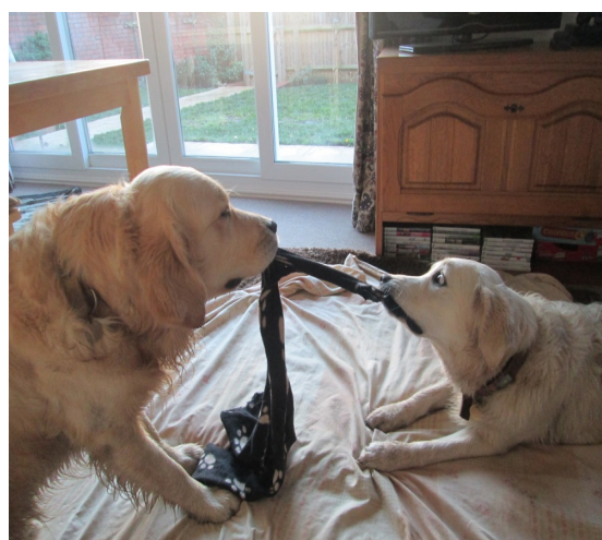
Tug of War!