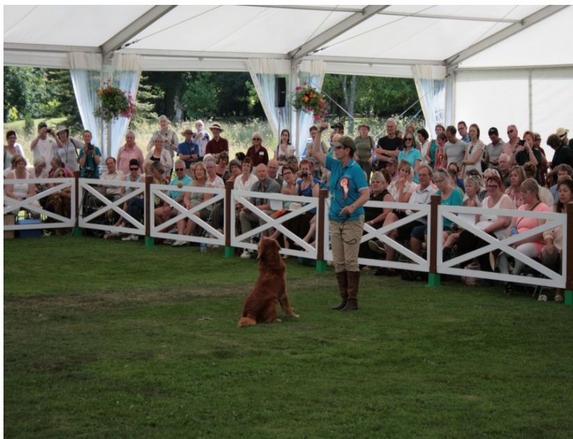
FTCh Castlemans Running Game in the Parade of Champions