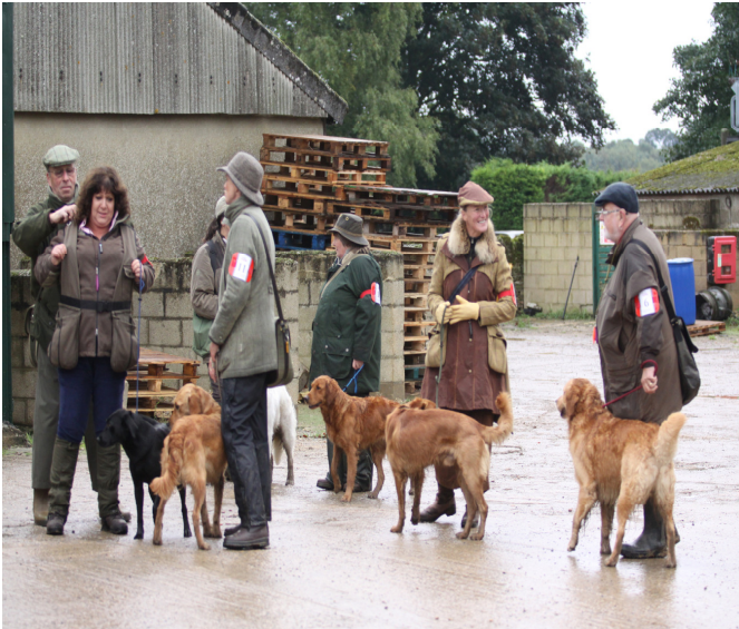
Competitors getting ready for the off