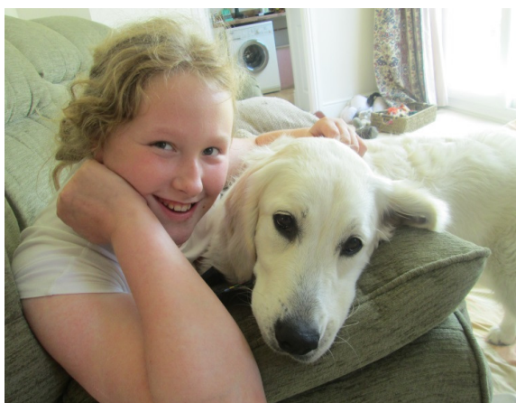
Bella having a cuddle with our daughter