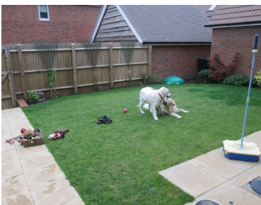
The first play at home! June 2013