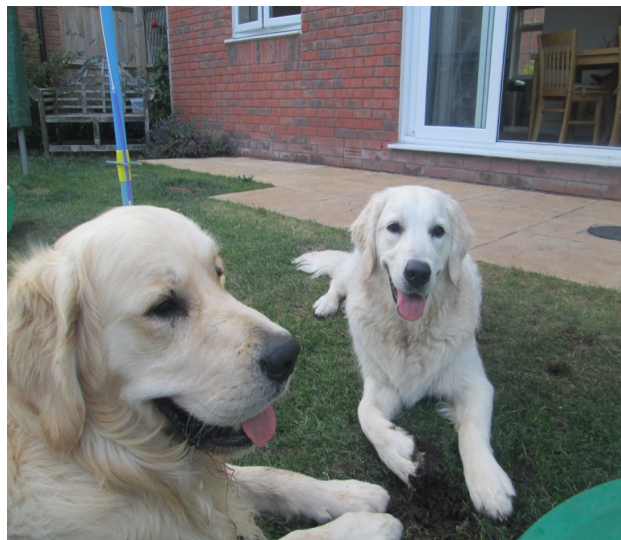
Relaxing together (Sam our golden boy with Bella poised with paws after digging!)